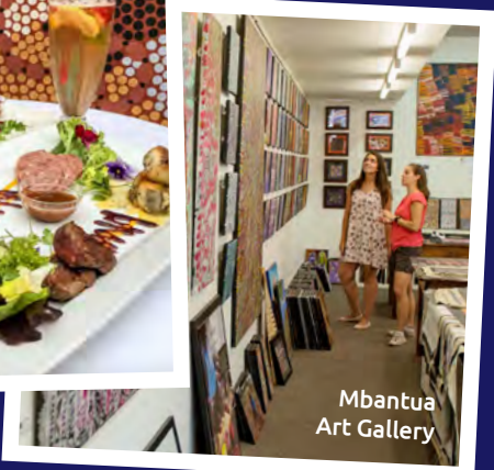
Mbantua Art Gallery