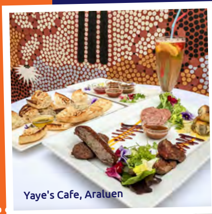
Yaye's Cafe, Araluen