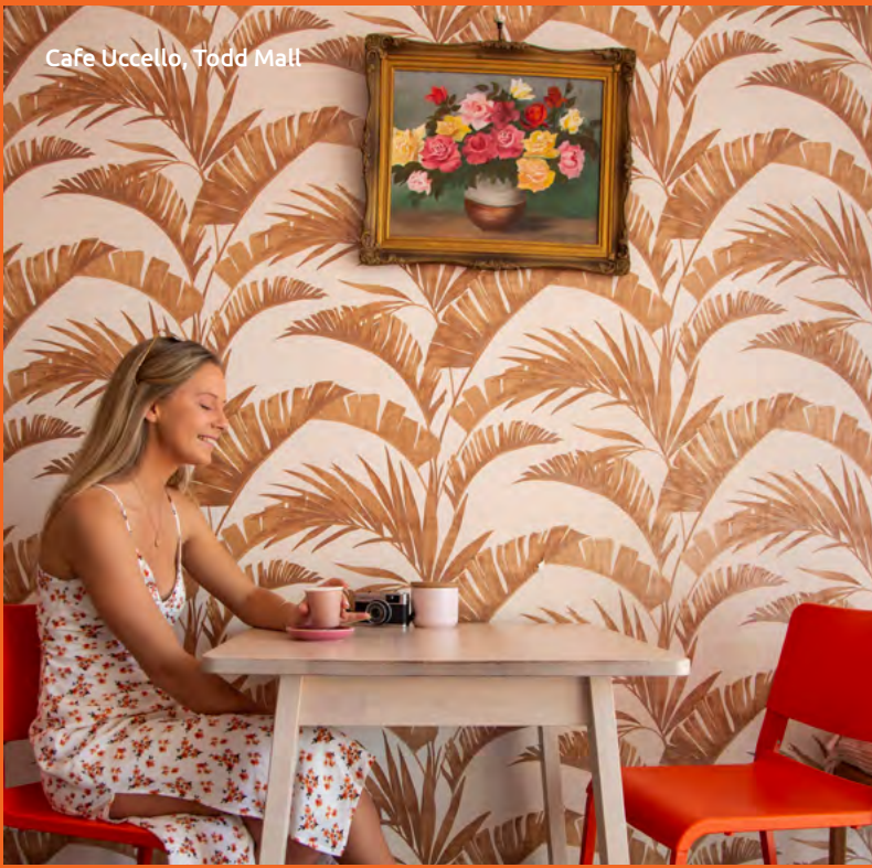
Cafe Uccello, Todd Mall