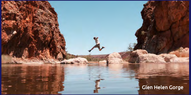
Glen Helen Gorge

Continue on along Larapinta Drive, turning right at Namatjira Drive. Approximately 80km along the Drive you will arrive at Glen Helen Homestead Lodge. The landscape around Glen Helen is truly spectacular with towering sandstone walls greeting you as you arrive. Enjoy your lunch teamed with a cold drink as you relax on the back verandah of the restored homestead overlooking the majestic Glen Helen Gorge .