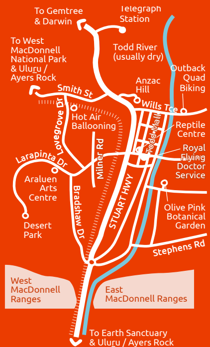
Alice Springs Town Map

Red CentreNATS invites the nation's petrol heads to 'meet in the middle' in the adventure hub of Alice Springs. But step through all the smoke and sidemirrors and you'll find the people attached to these awesome machines have awesome stories to tell. More than rubber, glass, and steel each vehicle is made of guts and determination – vessels for the great Australian dream.