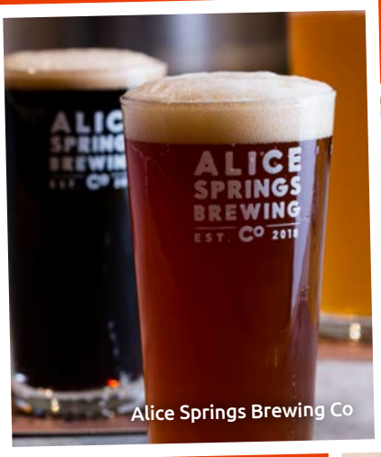
Alice Springs Brewing Co