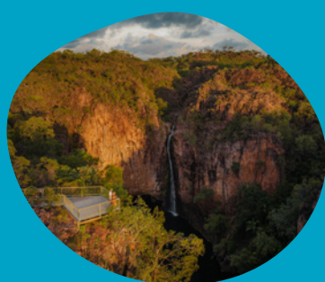
Above: Tolmer Falls, Litchfield National Park Left: Darwin Street Art Festival