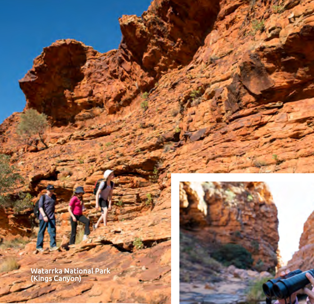
Watarrka National Park (Kings Canyon)