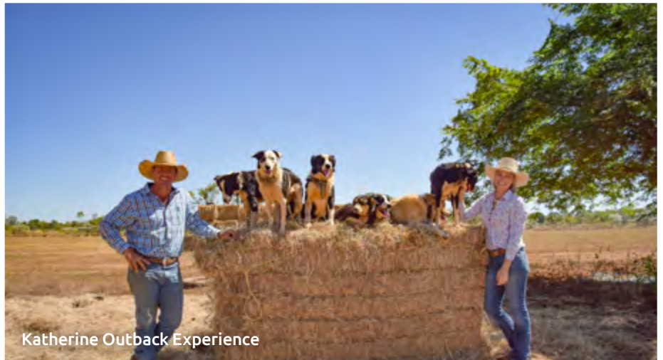
Katherine Outback Experience