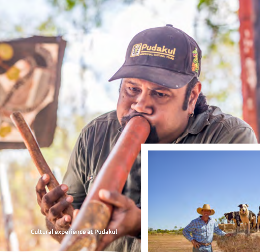
Cultural experience at Pudakul