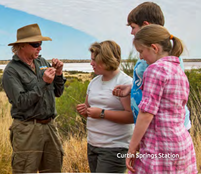
Curtin Springs Station