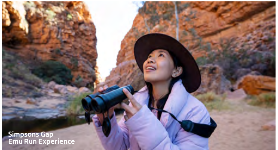
Simpsons Gap Emu Run Experience

A hands-on paper-making workshop using native grasses, a surreal salt lake and magnificent views of Mt Connor make Curtin Springs a learning destination not to be missed.