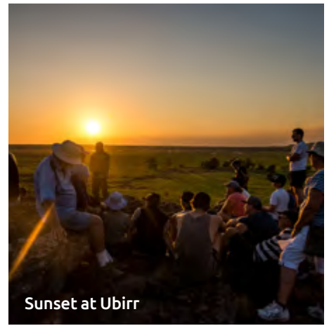
Sunset at Ubirr