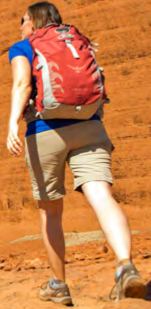
Exploring Kata Tjuta