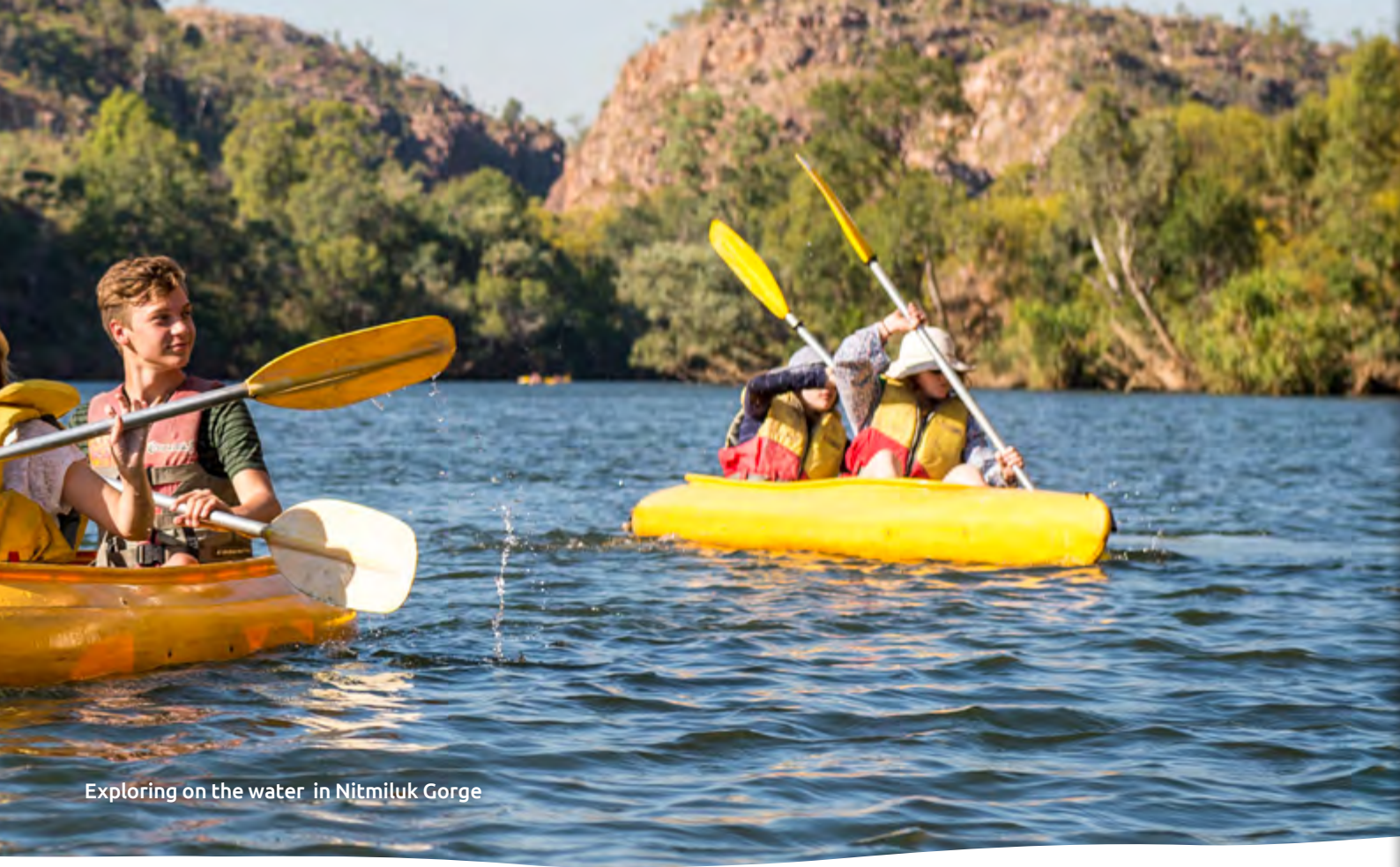
Exploring on the water in Nitmiluk Gorge

Take in the captivating views across the Nadab floodplains. After lunch join the Guluymbi Cultural Cruise (smaller groups only) for insights into local culture, mythologies and bush survival or, visit the Bowali Visitor Centre.