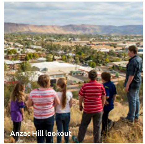
Anzac Hill lookout