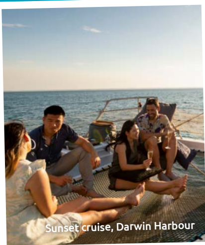
Sunset cruise, Darwin Harbour