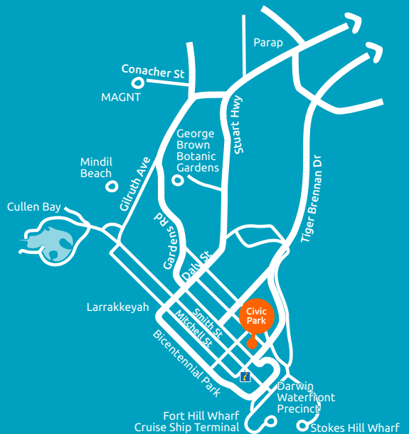
Darwin CBD map

Darwin is a colourful place at any time of year, but pack the capital with world-class art, music, dance, and theatre and the city becomes more vibrant than a tie dye t-shirt. Darwin Festival gives our balmy August nights a new meaning when it kicks off early in the month with its exuberance of hyperlocal and utterly Aussie performers. Take advantage of the tropical weather and party against the backdrop of our incredible indigo and purple sunsets while you soak up all the food, drink, fun, and multicultural flavour at the epicentre of it all at Festival Park.