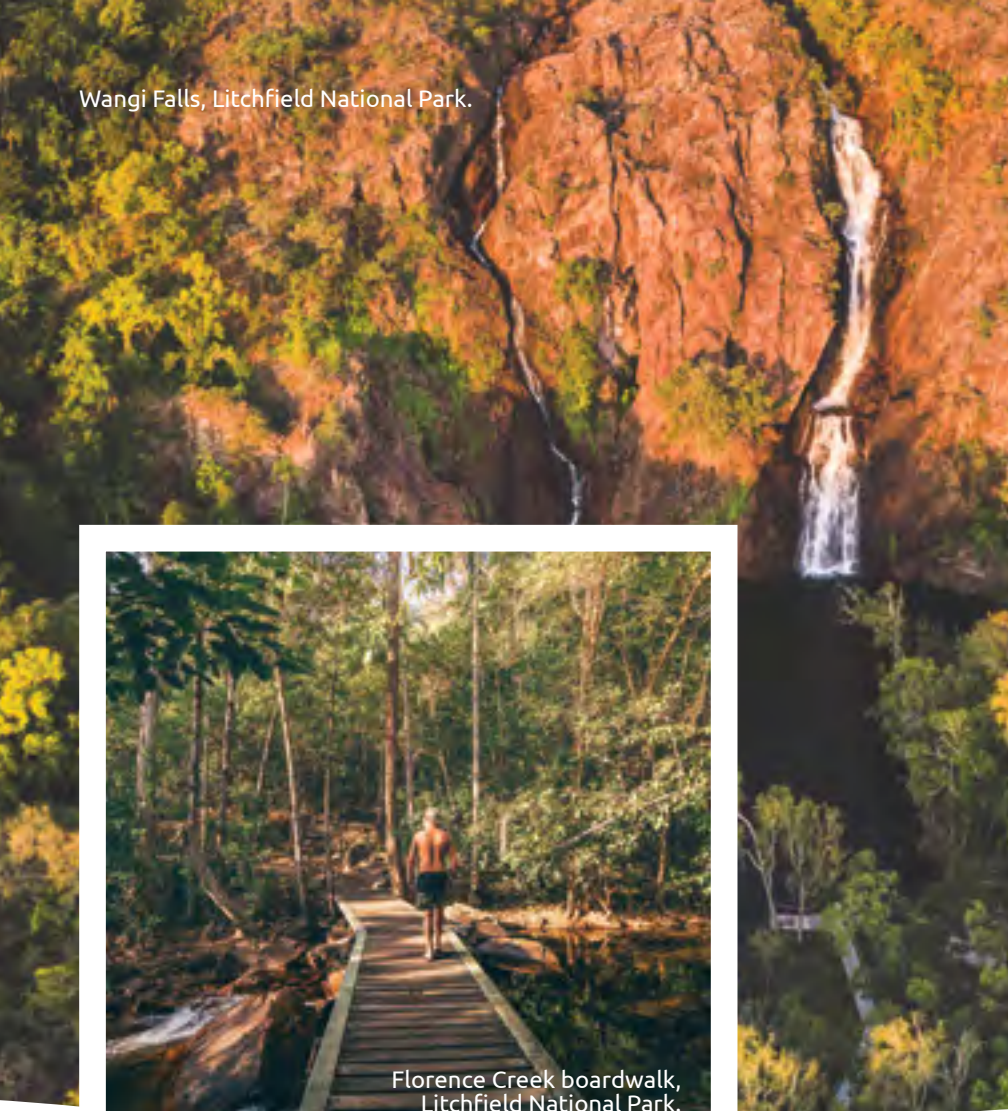
Wangi Falls, Litchfield National Park.