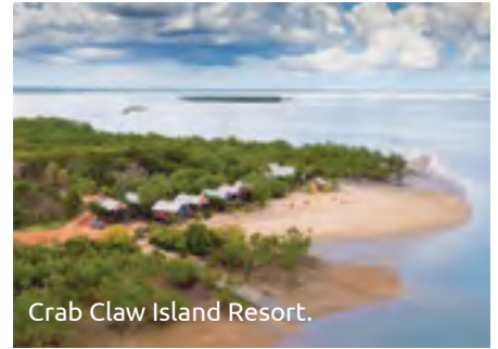
Crab Claw Island Resort.