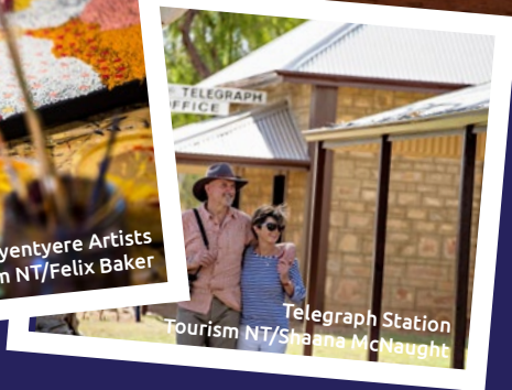
Telegraph Station

Rise early this morning and take to the skies in a hot air balloon for a magnificent bird's eye view of Alice Springs and the Red Centre. As you drift into an outback sunrise of pastel blues, purples and yellows, keep an eye out for native wildlife and the iconic Red Kangaroo down below. You'll need to book with Outback Ballooning a day or two in advance, and all tours are subject to weather suitability.