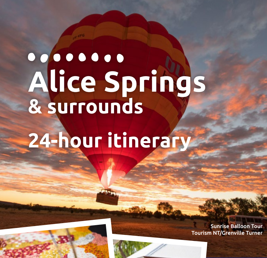
Sunrise Balloon Tour