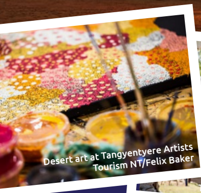
Desert art at Tangyentyere Artists