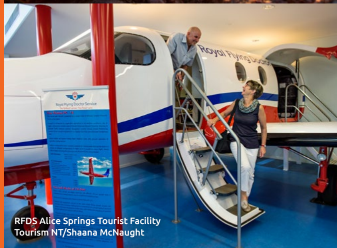
RFDS Alice Springs Tourist Facility