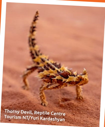
Thorny Devil, Reptile Centre

Head back into town to the Todd Mall, which is lined with commercial galleries specialising in Aboriginal art . Stop at Papunya Tula Artists to see the renowned dot paintings, then at Mbantua Art Gallery and Cultural Museum, which has one of the largest collections of Aboriginal art in Australia and specialises in art from the Utopia region. While you're in the area, enjoy lunch at one of the many trendy café's dotted throughout the Todd Mall.