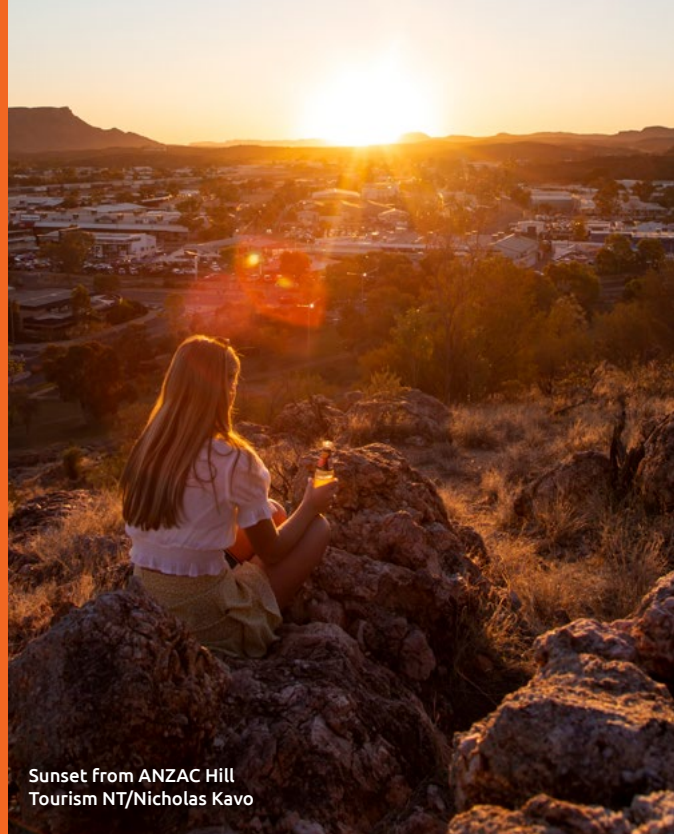
Sunset from ANZAC Hill

To finish off the day, make the most of the clear skies in the Red Centre and gaze at the thousands of stars overhead at the Earth Sanctuary World Nature Centre . Learn how to navigate and identify the zodiac and constellations in the night sky and hear ancient Aboriginal stories of creation.