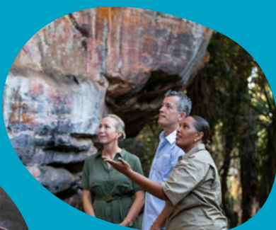
Above: Rock art at Ubirr, Kakadu Left: Nitmiluk Gorge Tour Right: Tiwi Islands Football Grand Final & Annual Art Sale