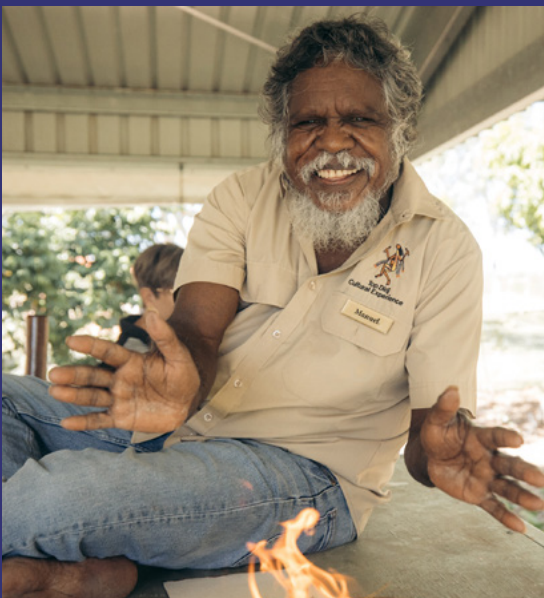
Top: Pudakul Aboriginal Cultural Tours, Darwin region Above: Top Didj Cultural Experience, Katherine region