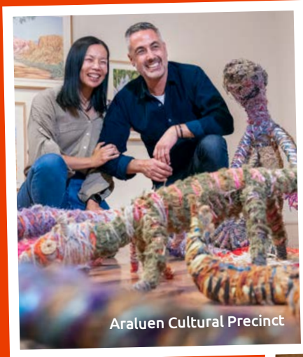
Araluen Cultural Precinct