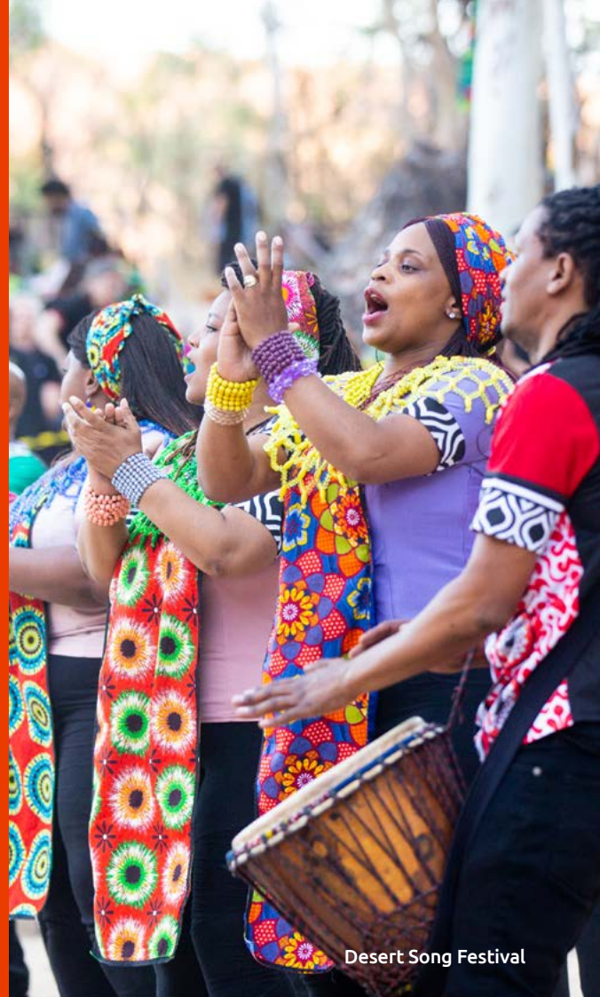
Desert Song Festival