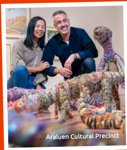
Araluen Cultural Precinct