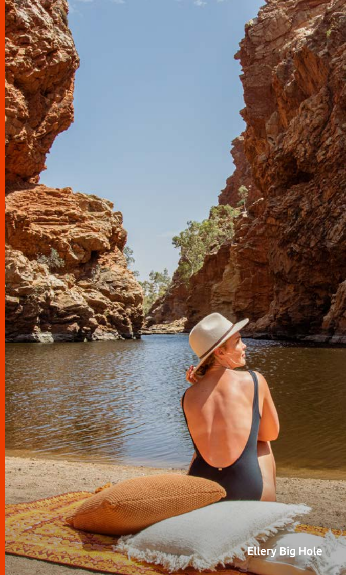
Ellery Big Hole