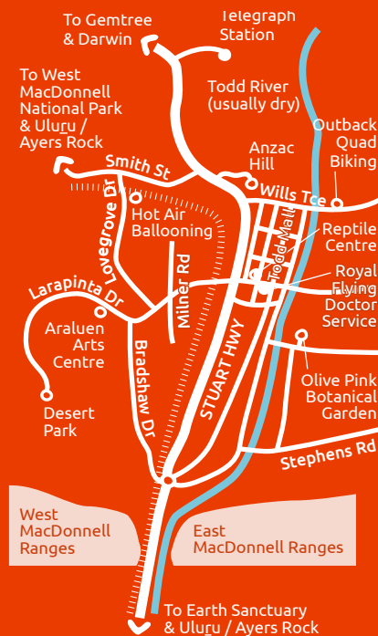
Alice Springs Town Map

The stunning MacDonnell Ranges and gorges of Central Australia, known for their spiritual significance to the traditional owners, create a backdrop like nowhere else to hold a celebration of the musically talented locally and from abroad. Desert Song Festival celebrates Aboriginal language and culture through choir, solo, and audience-led events. Be moved by the depth of wisdom and stories of this unique and unforgettable event.