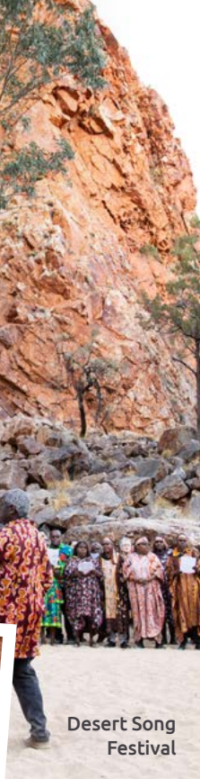
Desert Song Festival