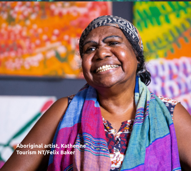
Aboriginal artist, Katherine