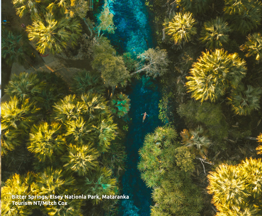
Bitter Springs, Eley National Park, Mataranka