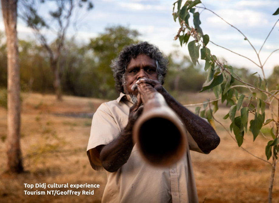
Top Didj cultural experience