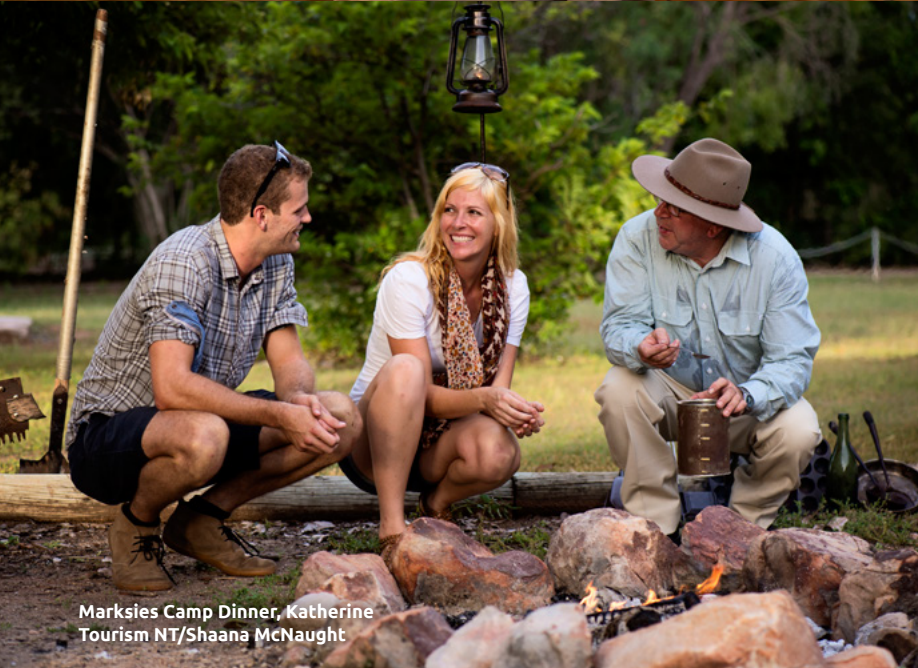
Marksies Camp Dinner, Katherine