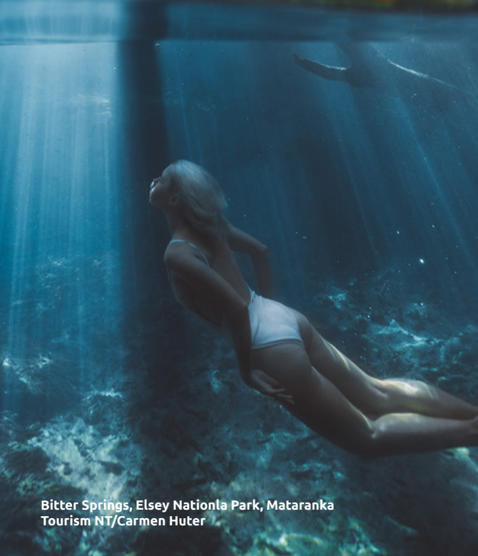
Bitter Springs, Eley National Park, Mataranka