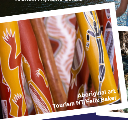
Aboriginal art