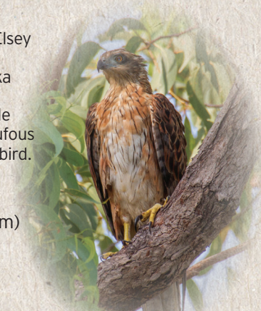
Red Goshawk