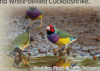
Gouldian Finch