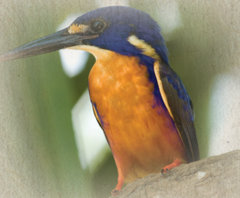
Azure Kingfisher