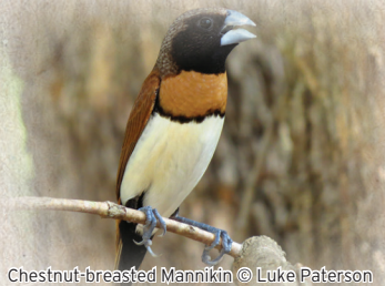
Chestnut-breasted Mannikin