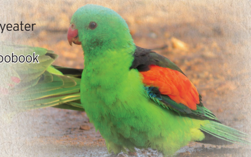
Red-winged Parrot