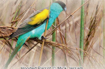
Hooded Parrot