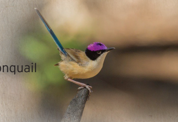
Purple-crowned Fairywren © Mick Jerram