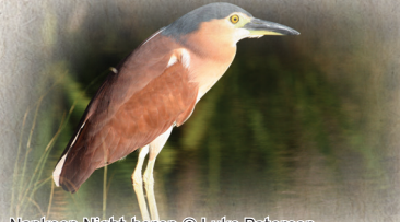
Nankeen Night-heron