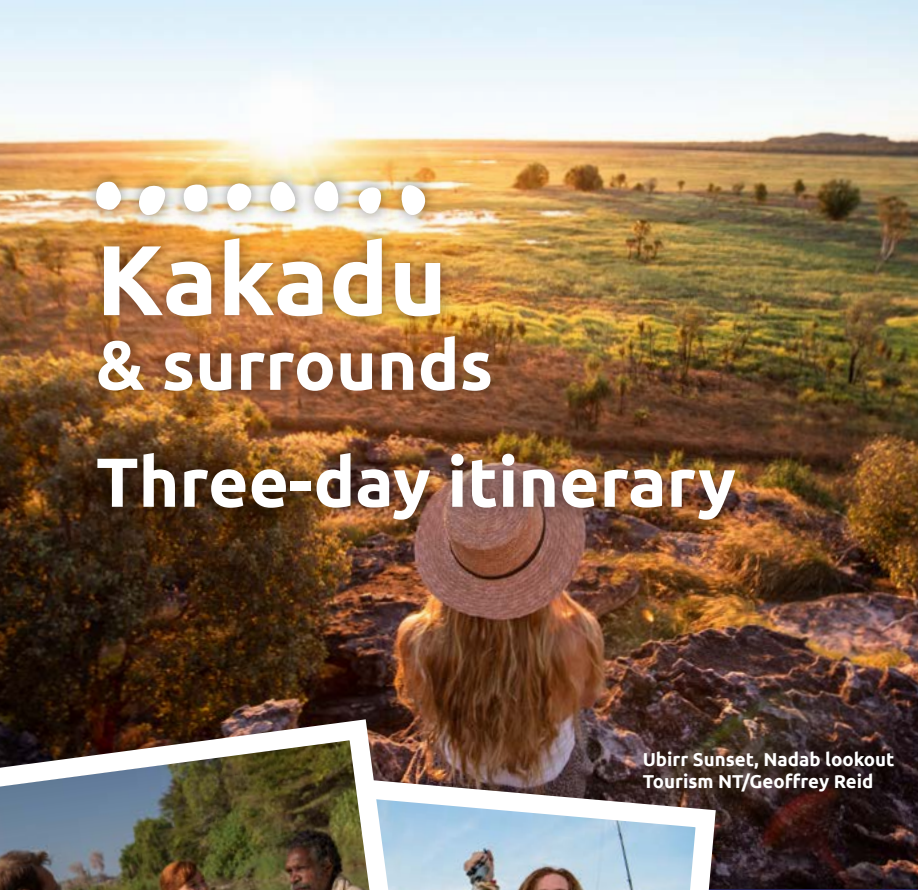
Ubirr Sunset, Nadab lookout