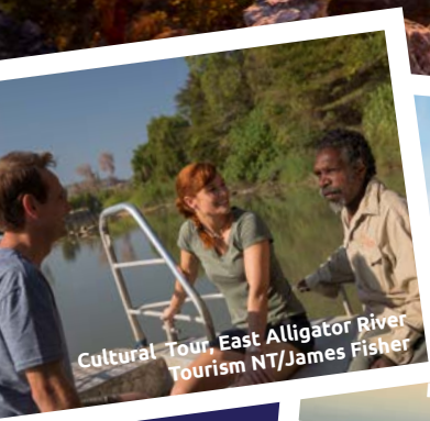
Cultural Tour, East Alligator River