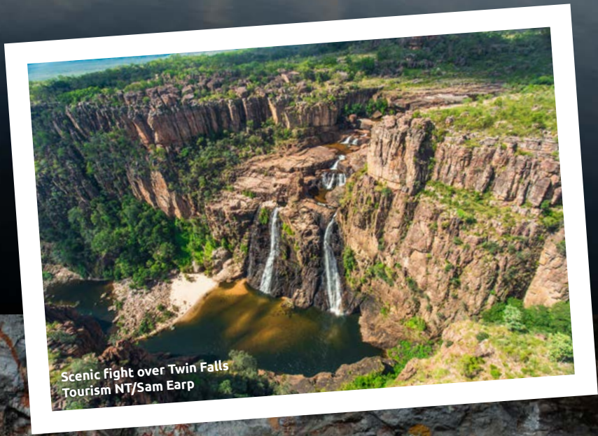
Scenic flight over Twin Falls