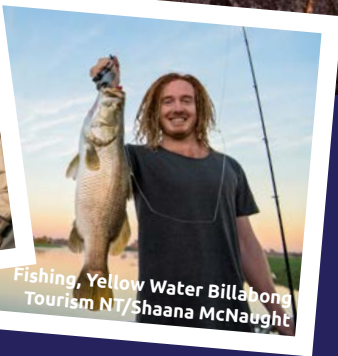
Fishing, Yellow Water Billabong