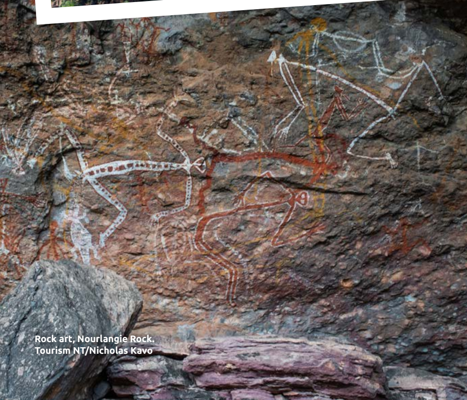
Rock art, Nourlangie Rock.