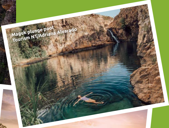
Maguk plunge pool