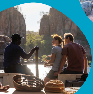
Above: Rock art at Ubirr, Kakadu Left: Nitmiluk Gorge Tour Right: Tiwi Islands Football Grand Final & Annual Art Sale