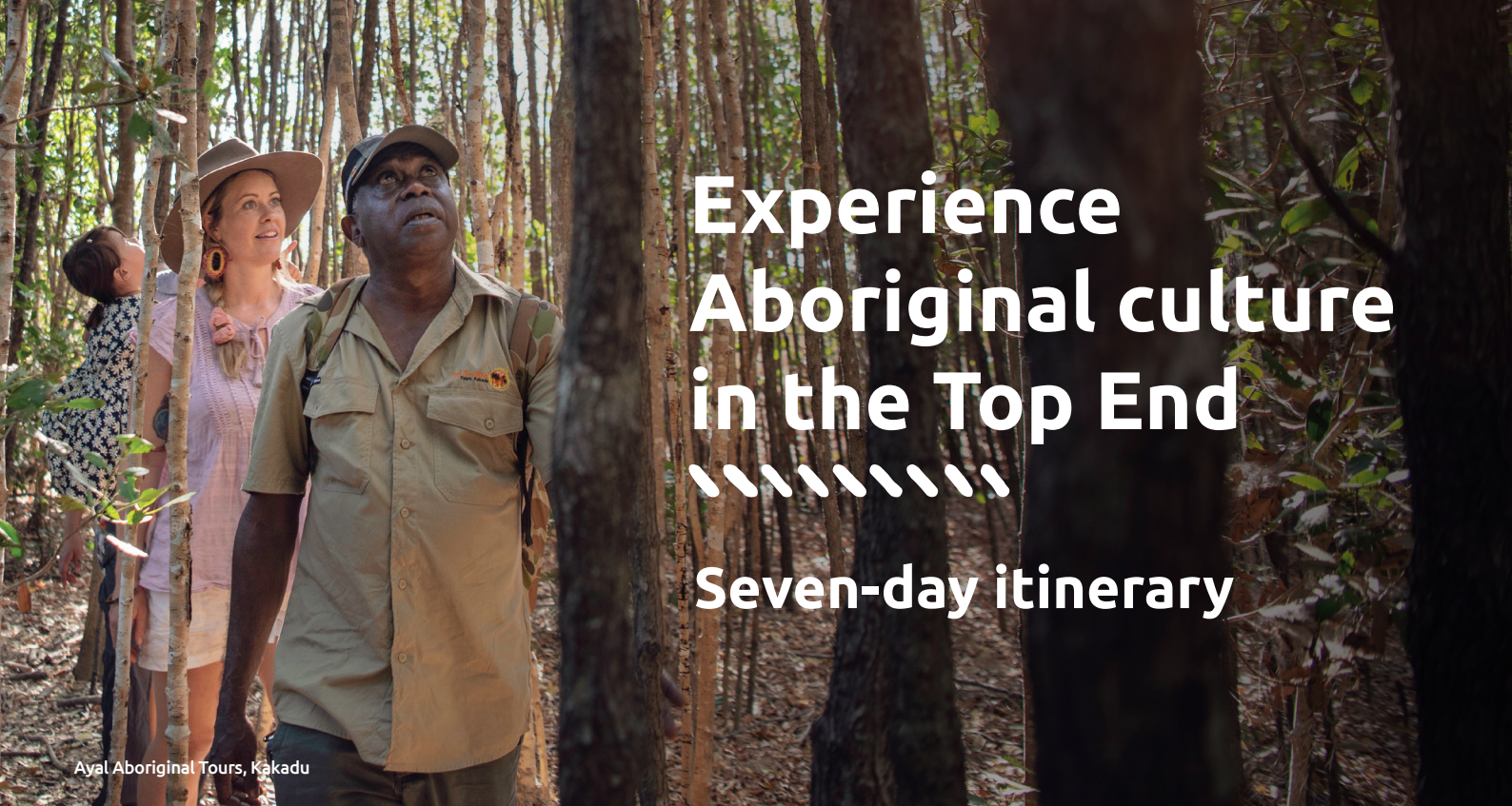
Ayal Aboriginal Tours, Kakadu