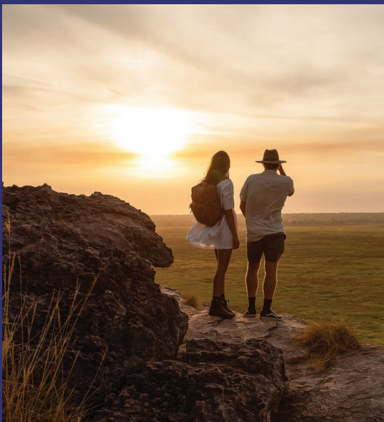
Top: Pudakul Aboriginal Cultural Tours, Darwin region Above: Sunset from Ubirr, Kakadu