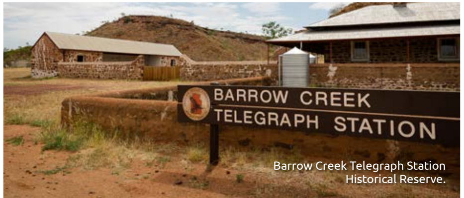
Barrow Creek Telegraph Station Historical Reserve.

powered or unpowered caravan and camping site, or in a cabin. Try your luck fossicking for semi-precious stones such as zircons and red garnets.