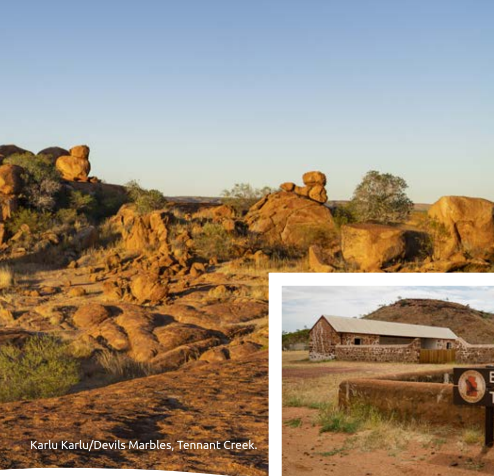
Karlu Karlu/Devils Marbles, Tennant Creek.