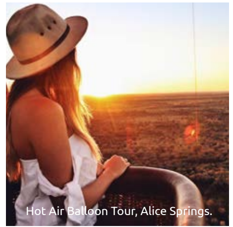
Hot Air Balloon Tour, Alice Springs.