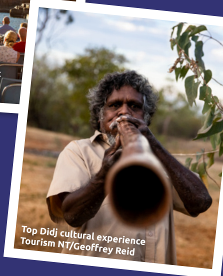
Top Didj cultural experience