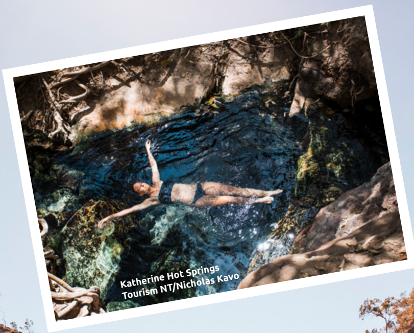
Katherine Hot Springs