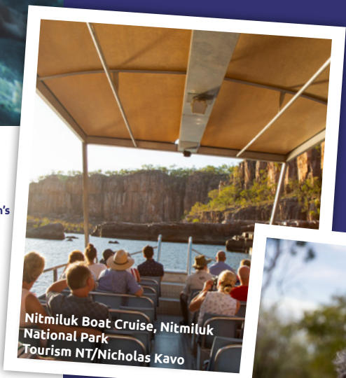
Nitmiluk Boat Cruise, Nitmiluk National Park