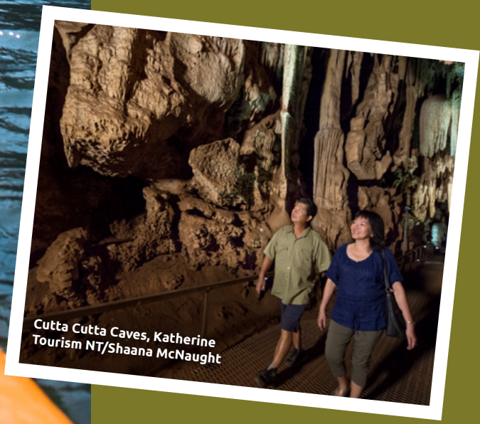
Cutta Cutta Caves, Katherine

Canoe hire, Nitmiluk Gorge, Nitmiluk National Park