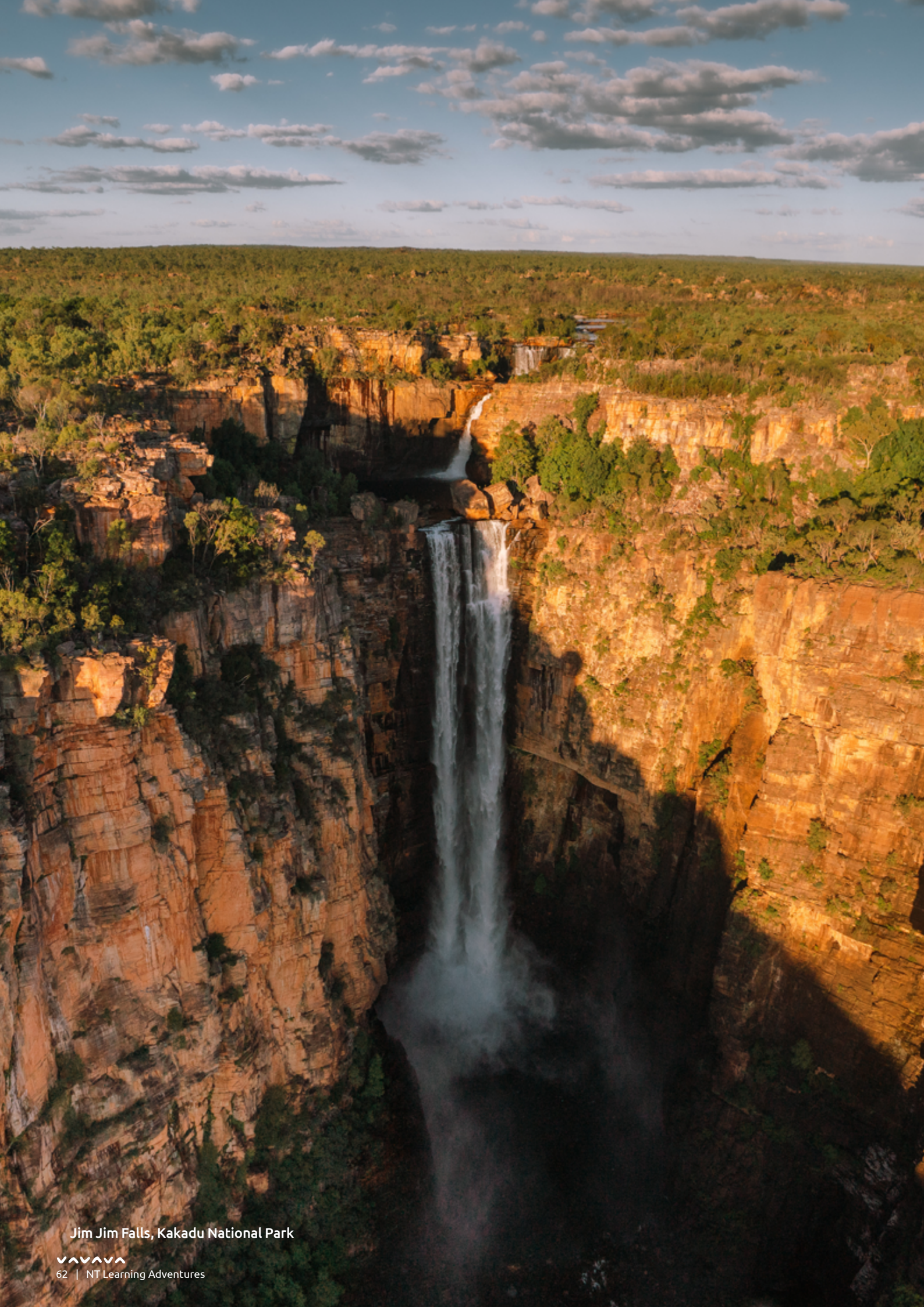
Jim Jim Falls, Kakadu National Park