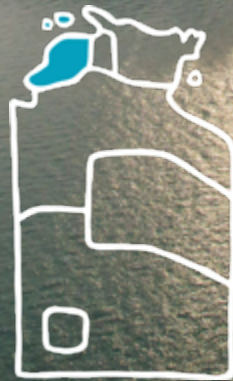
Museum and Art Gallery of the Northern Territory, Darwin