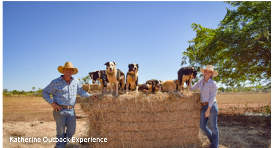
Katherine Outback Experience

Complete the final 400km drive to Alice Springs, where you'll stay for the next two nights. Drive up ANZAC Hill this evening for stunning views of the town and the MacDonnell Ranges.