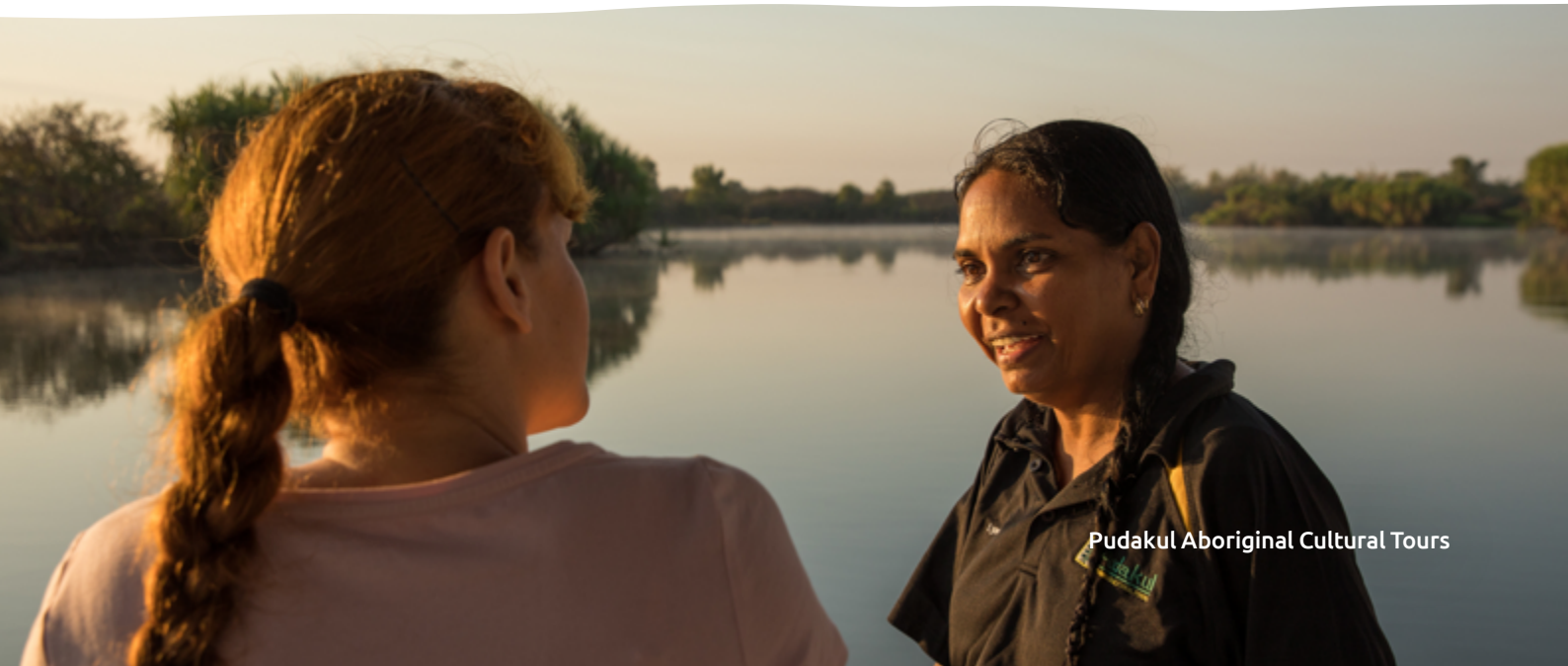
Pudakul Aboriginal Cultural Tours