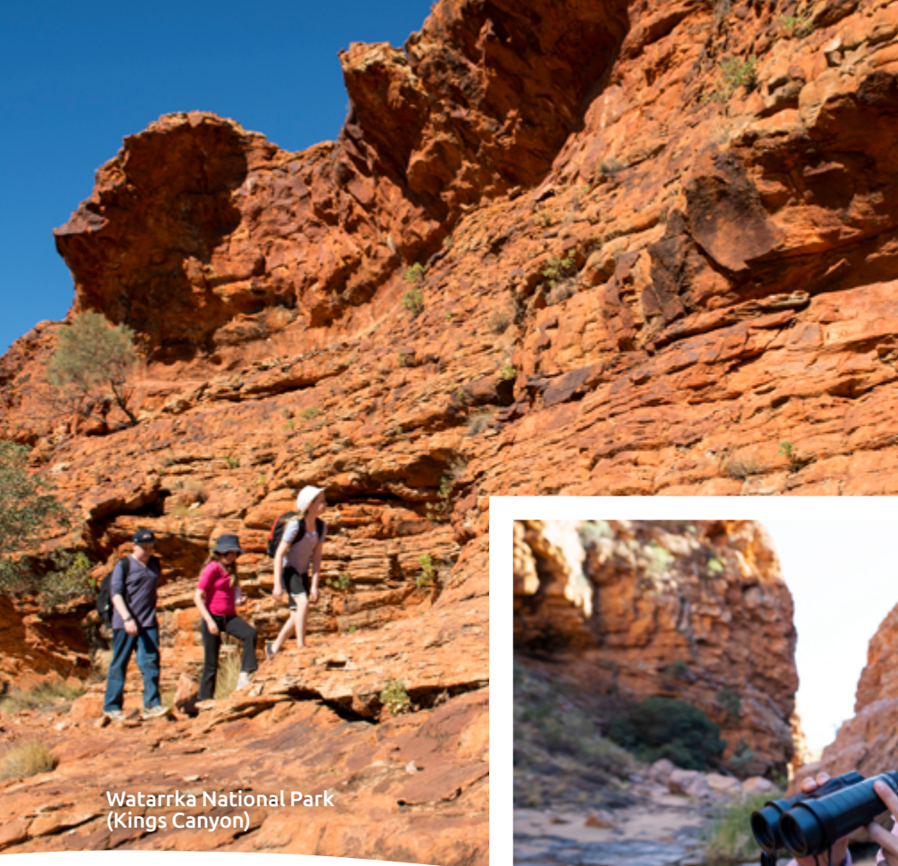
Watarrka National Park (Kings Canyon)