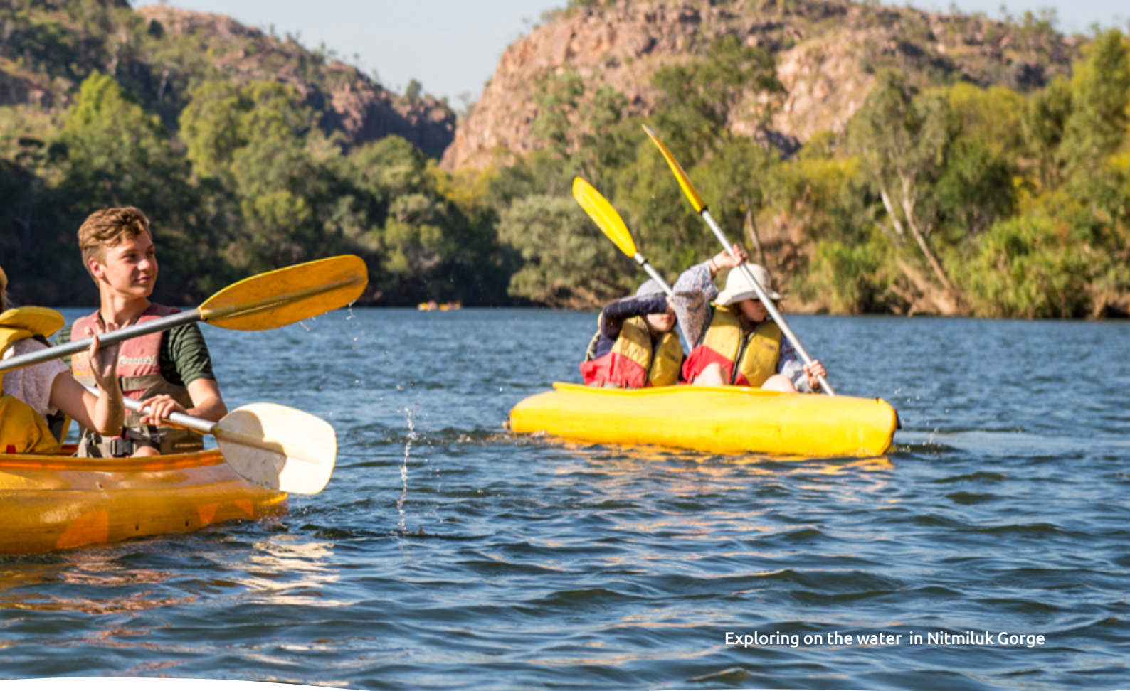
Exploring on the water in Nitmiluk Gorge

Take in the captivating views across the Nadab floodplains. After lunch join the Guluyambi Cultural Cruise (smaller groups only) for insights into local culture, mythologies and bush survival or, visit the Bowali Visitor Centre.