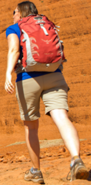
Exploring Kata Tjuta