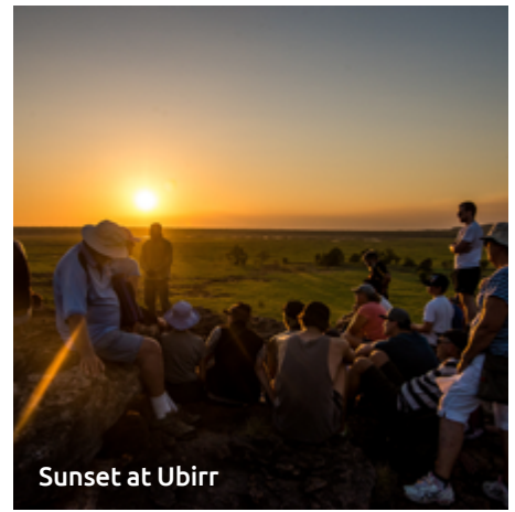
Sunset at Ubirr