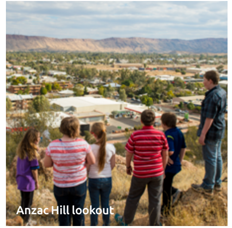
Anzac Hill lookout