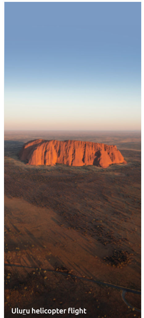
Uluru helicopter flight

Explore the Yulara town square for those last minute souvenirs before you depart for the airport.