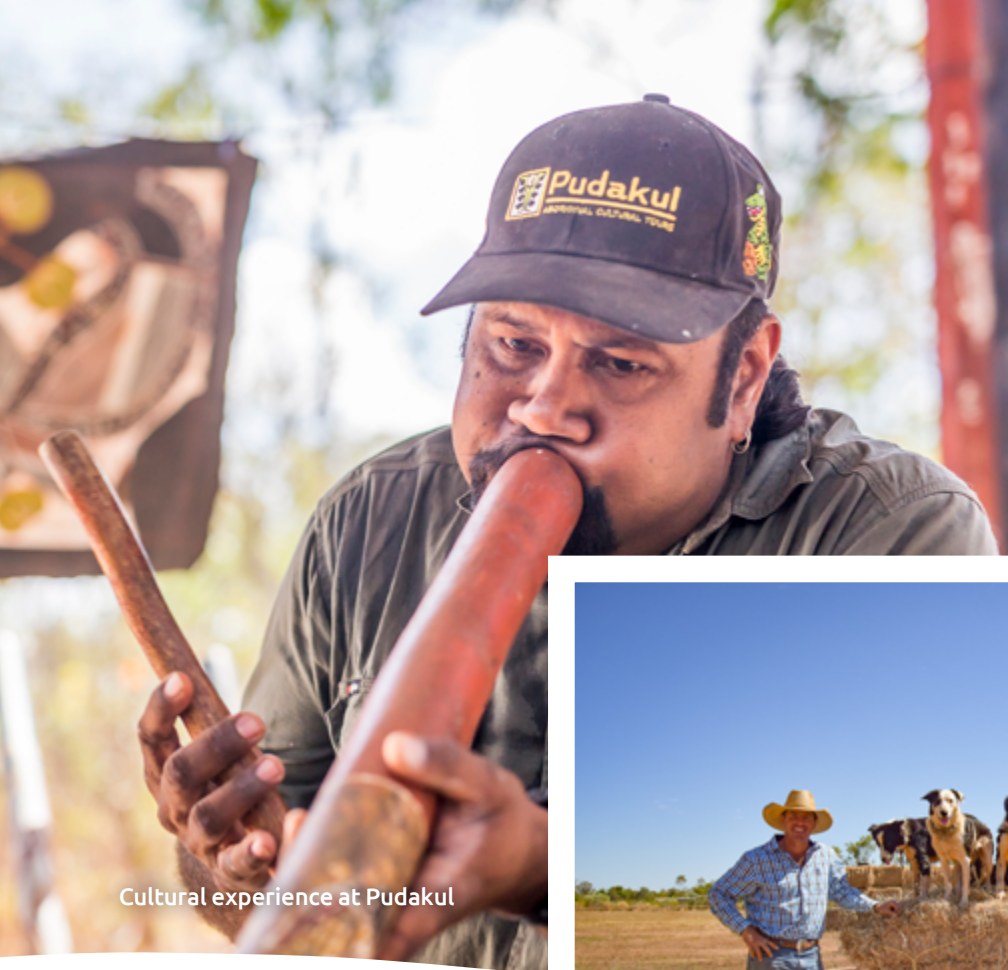
Cultural experience at Pudakul