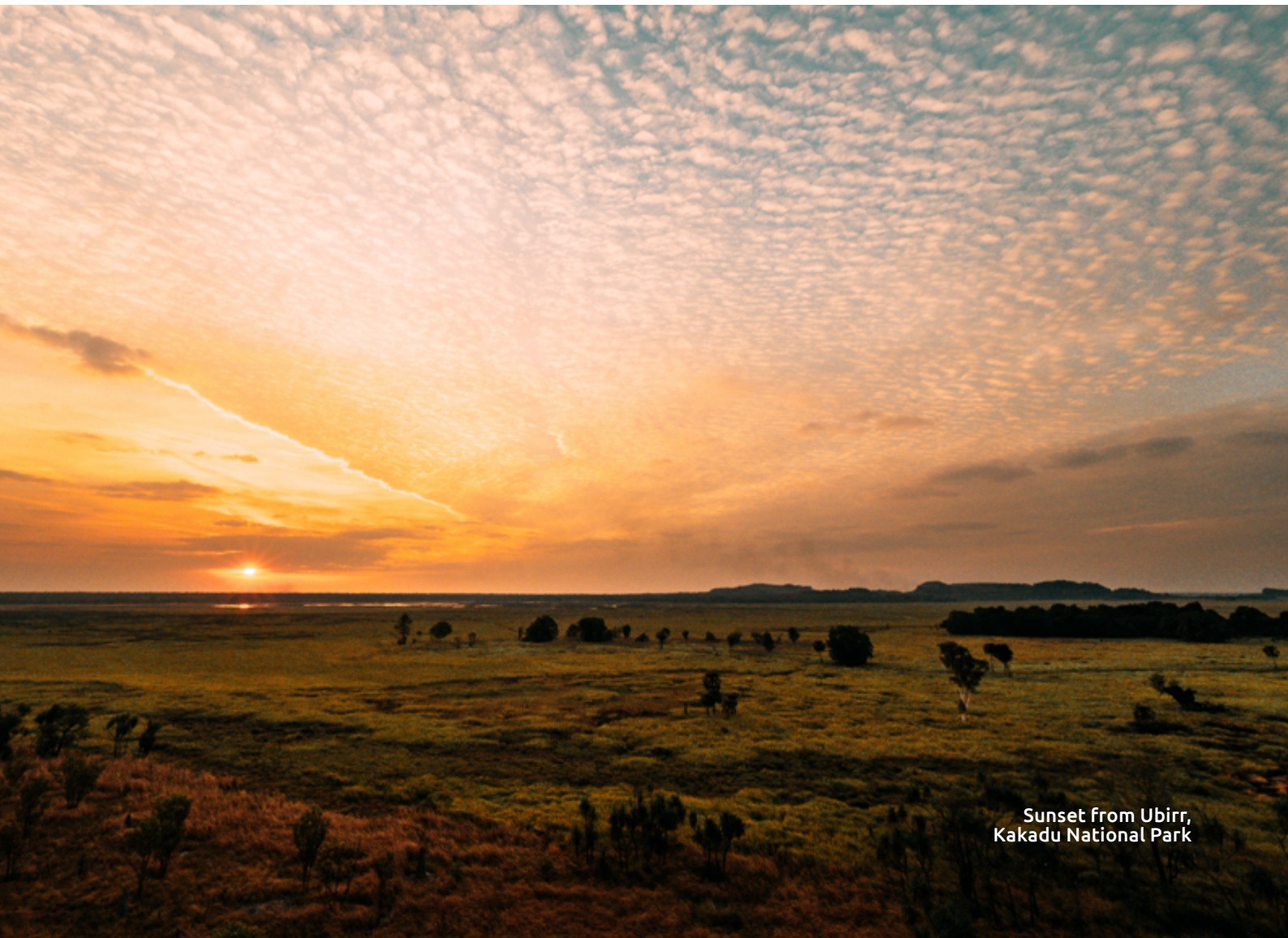
Sunset from Ubirr, Kakadu National Park

The NT Learning Adventures Save and Learn program provides funding to schools, making it even easier to bring your students to this truly captivating part of Australia. Cover key learning areas, general capabilities and cross-curriculum priorities while on the learning adventure of a lifetime - in the Northern Territory.