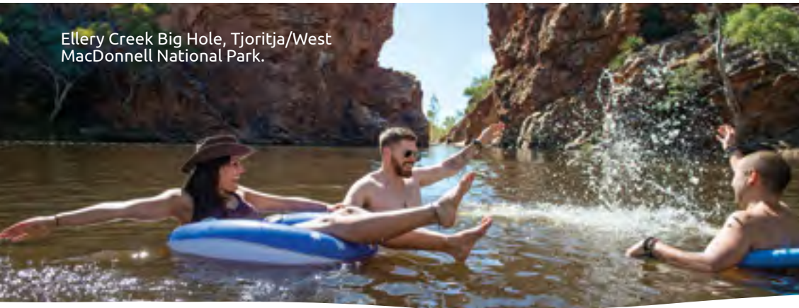
Ellery Creek Big Hole, Tjoritja/West MacDonnell National Park.