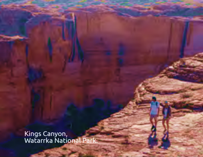
Kings Canyon, Watarrka National Park.