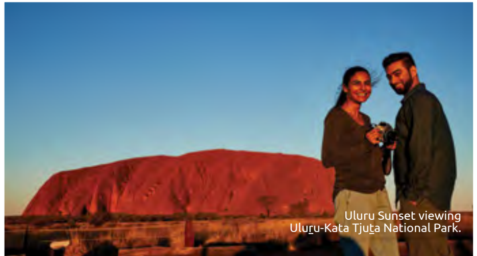
Uluru Sunset viewing Uluru-Kata Tjuṯa National Park.