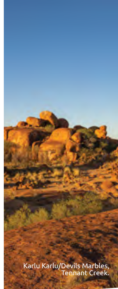
Karlu Karlu/Devils Marbles, Tennant Creek.