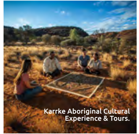
Karrke Aboriginal Cultural Experience & Tours.