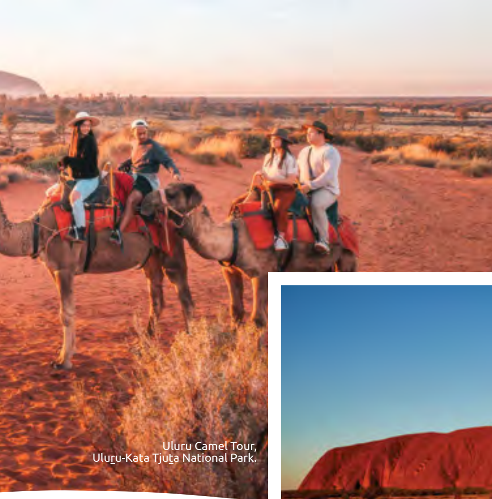
Uluru Camel Tour, Uluru-Kata Tjuṯa National Park.