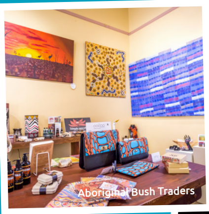
Aboriginal Bush Traders