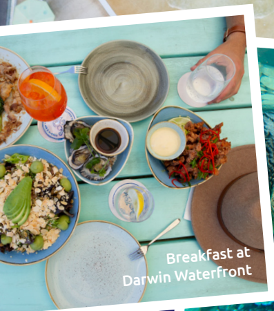
Breakfast at Darwin Waterfront